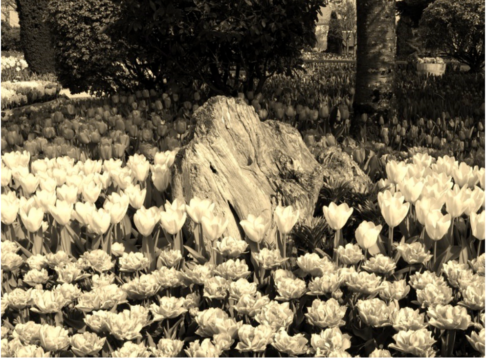
Achromatopsia: inability to see color; I can see some colors, but not consistently