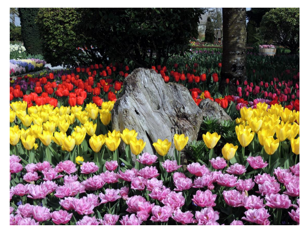
Normal color vision