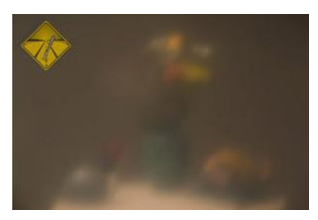
20/200 (My vision is slightly worse than this as my acuities are 20/270)